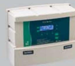
RPD Series 8

Control of both pH and Sanitiser level means a reduction in the amount of sanitiser used, as the effectiveness of the Sanitiser is kept at its peak, saving you money and creating the safest and most comfortable swimming environment.